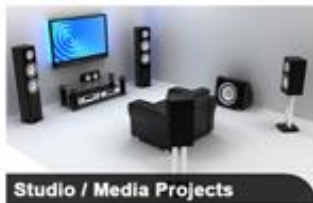
Studio / Media Projects