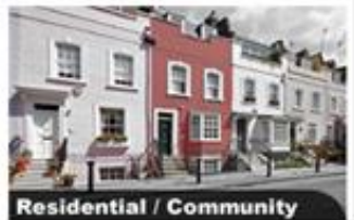
Residential / Community

...amazing results. Totally transformed the space. It sounds so clear. Impressed!